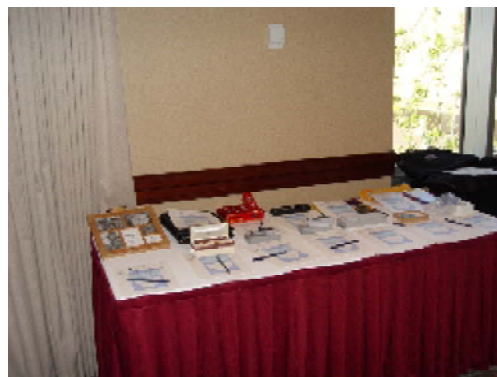
Southwest and North Central Areas raise money for the American Enterprise Speech Contest at their Silent Auction.

Southwest / North Central April 24-26 Albuquerque, New Mexico