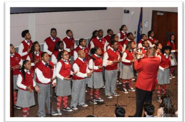
The Detroit Youth Choir performs

In addition, several volunteers from our BCBSM LDA chapter, Blue Acts, and Toastmasters chapters within Blue Cross and the surrounding area helped to make the event a success.