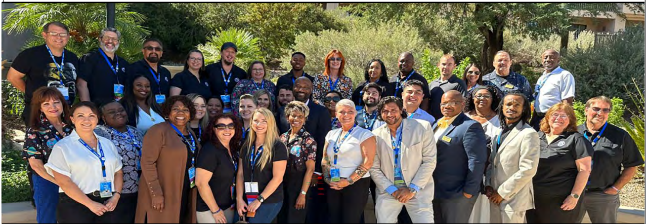
NMA members from Lockheed Martin chapters across the nation posed for a group photo during the 2023 NMA Annual Conference at the Westin LaPaloma in Tucson, AZ.